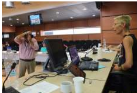
Fig. 4: Stakeholder representatives