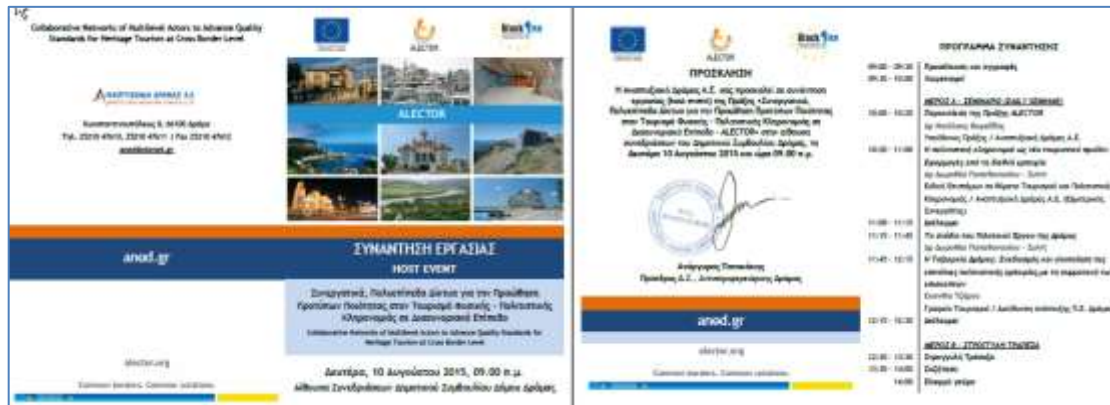
Fig. 7: Stakeholder Invitation

It is expected that 30 stakeholders and organization will sign the ALECTOR non-statutory cooperation agreement (NSCA) and thus enter the Black Sea Heritage Observatory as final beneficiaries. 3 Press releases demonstrate the vivid interest of the local press for the cultural heritage project in the “Golden Tobacco Age